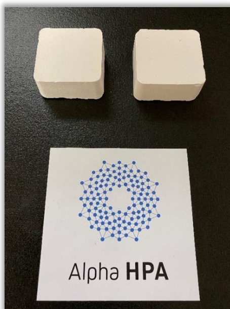
HPA pellets for sapphire glass end-users (~45 x 45 x 20mm)

Following this brief commissioning phase, the Company has now commenced manufacture of HPA pellets of the desired size and density to match sapphire glass customer requirements (see photo below).