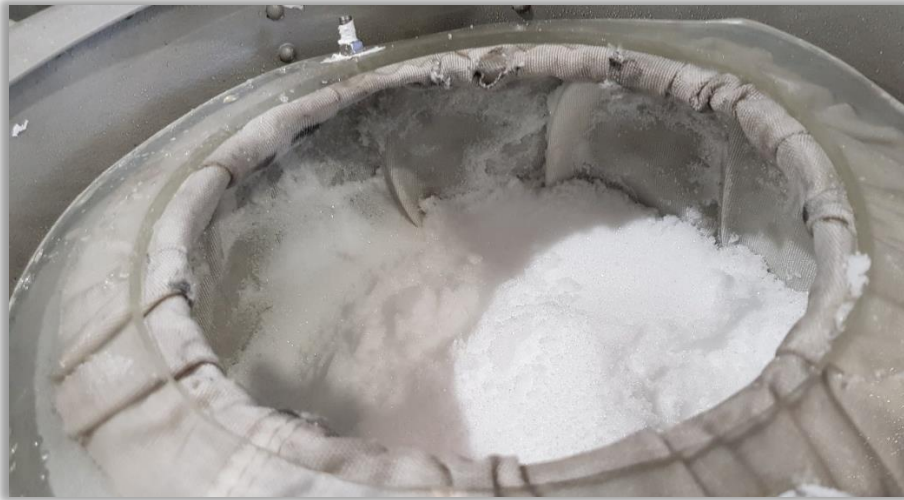
A centrifuge batch of high-purity pre-cursor product (approx. 2kg) produced at Alpha HPA's demonstration facility

In response to this development, and in co-operation with Traxys, Alpha HPA has expanded its market outreach with pre-cursor material available for immediate shipment from its Brisbane demonstration-scale Pilot Plant.