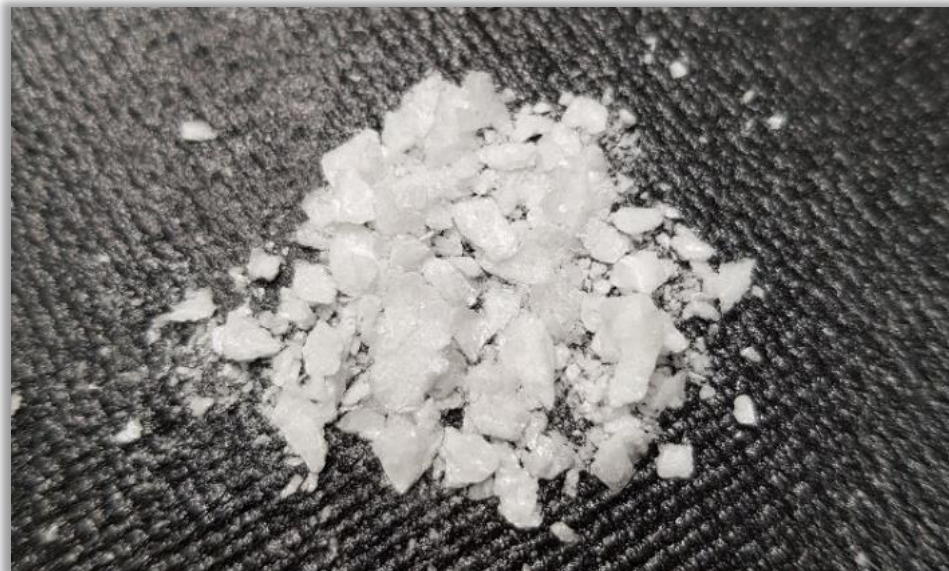
High-purity (99.995%), lithium-ion cathode pre-cursor

The pre-cursor material can be readily produced with only modest adjustments to the existing HPA First Process flow sheet, with the Company now mobilising additional equipment to the Brisbane plant in anticipation of receiving end-user sample orders for this pre-cursor. In co-operation with Traxys, Alpha HPA has expanded its market outreach activities accordingly.