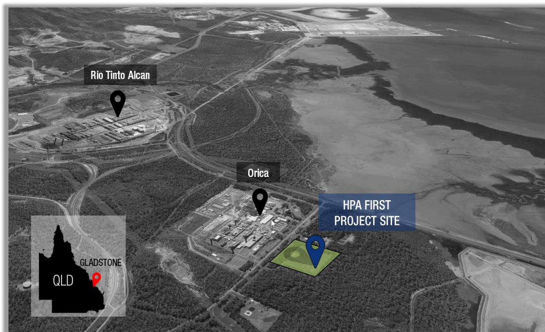
HPA First Project Site – Gladstone State Development Area, North Queensland

Both Orica and the Company are pleased with the progress to date and accordingly mutually agreed to extend the exclusivity arrangement within the MoU through to 31 October 2020.