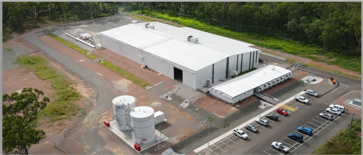
Completed Stage 1 PPF