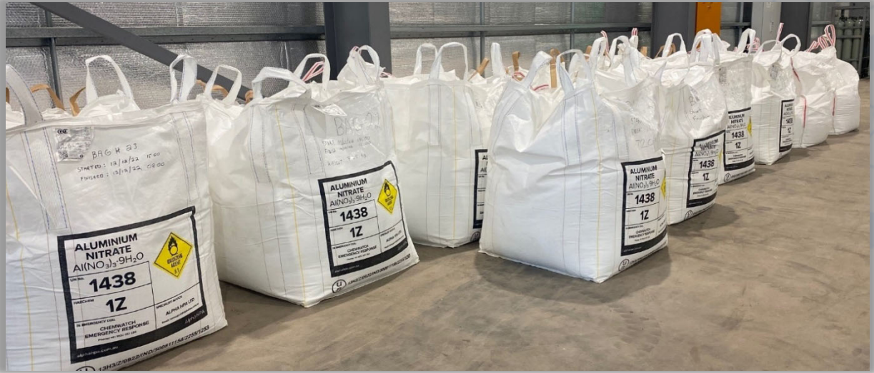
5N purity aluminium nitrate inventory